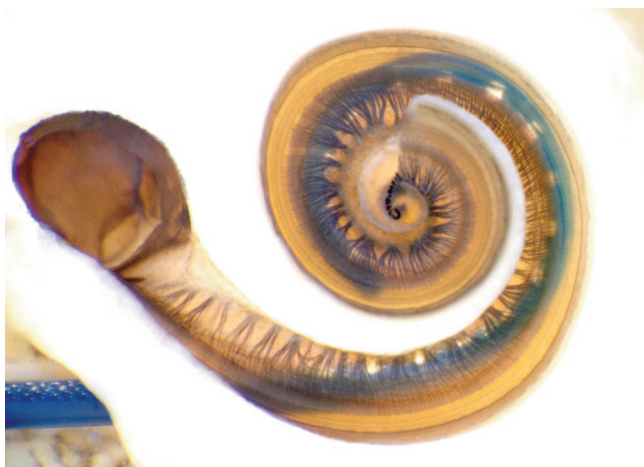
Fig. 4. A Helix II electrode seen through the intact basilar membrane and osseous lamina in a cochlear dissection (preparation 4). No evidence of trauma is seen anywhere along the electrode's path. This electrode illustrates the usual positioning observed for this array in this study. That is, the electrode is close to modiolus in the lower base, then deviates outward to contact the lateral wall in the mid-base and finally approaches the modiolus again in the area occupied by the apical portion of the electrode.

The electrode shown in Figure 4 illustrates positioning within the scala tympani that was typical of the Helix II arrays evaluated in this study. Information on insertion depth and modiolar proximity for these electrodes is given in Tables III and IV. The Helix II electrodes all tended to show close proximity to the modiolus in the lower basal turn, then deviated outward to contact the lateral wall of the scala tympani in the region between approximately 135 and 225 degrees, and finally approached the modiolus again in the area occupied by the apical contacts of the electrode. As would be expected for an electrode that tracts closer to the modiolus over a substantial part of its length (and therefore has a somewhat tighter spiral), the