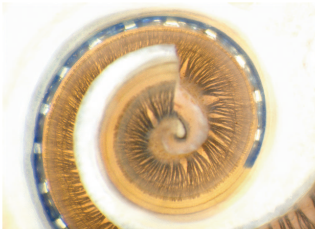
Fig. 3. Higher-power view of the electrode shown in Figure 1. Twelve contacts are visible. Electrode is appropriately positioned against the lateral cochlear wall immediately beneath the basilar membrane. Electrode tip has not impacted the spiral ligament or elevated the basilar membrane.

The electrode shown in Figure 4 illustrates positioning within the scala tympani that was typical of the Helix II arrays evaluated in this study. Information on insertion depth and modiolar proximity for these electrodes is given in Tables III and IV. The Helix II electrodes all tended to show close proximity to the modiolus in the lower basal turn, then deviated outward to contact the lateral wall of the scala tympani in the region between approximately 135 and 225 degrees, and finally approached the modiolus again in the area occupied by the apical contacts of the electrode. As would be expected for an electrode that tracts closer to the modiolus over a substantial part of its length (and therefore has a somewhat tighter spiral), the