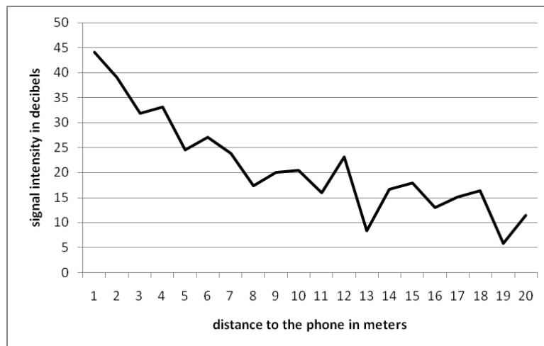
Fig. 1. Relationship between signal strength and distance for conditions where SmartPhone speaker and microphone point at each other.

In previous work [16], we tested the useable range of SmartPhone ultrasound to find that these signals can indeed be successfully detected up to distances of 20m or more (Figure 1). In this experiment, two values below 10 dB were registered but this is still well above the 21.5 KHz component of background noise, which is around 1 dB. However there is no guarantee that the maximum value belongs to a signal that arrived by direct path and not via a longer deflected path. In any case, it can be seen from the shape of the graph that even with speaker and microphone pointing directly at each other, signal strength can't be relied on alone to accurately measure distance.