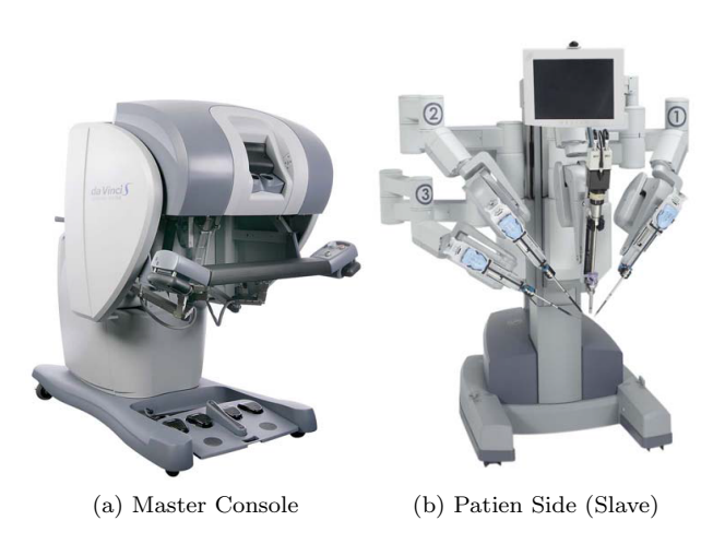
Figure 1: daVinci S Surgical System Components [6]

Intuitive Surgical Inc. has been developing robotic surgery products since 1995. Currently, ISI has three generations of daVinci robotic systems viz. STANDARD , S (system in Hackerman 134 - Mock OR, JHU), and SI . The daVinci robot is a tele-robotic system (Fig. 1) with a master console from where the surgeon can see a stereoscopic view of the slave (patient) side with the use of a stereo endoscope mounted on one of the robotic slave arms. The surgeon uses Master Tele Manipulators (MTM's) to control the configuration of the Patient Side Manipulators (PSM's) which have seven degrees of freedom. While the system has its advantages for making minimally invasive surgery simpler and more intuitive, it has shortcomings for training surgeons to use it. For example, the system large and requires a spacious room for setting up a training center; like most surgical training equipment phantoms get wasted; a daVinci robot is a scarce resource in medical institutions with less time alloted for surgical training.