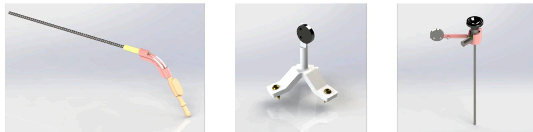
Figure. 2, 3 & 4: Pictures of the final design of (from left to right): the suction tool, the head reference adapter, the endoscope adapter.

At the same time, I also designed a detailed workflow including the preparation of the cadaver head, the setup of the system, the post-processing of the cadaver head, and the clean up of the surgical tools.