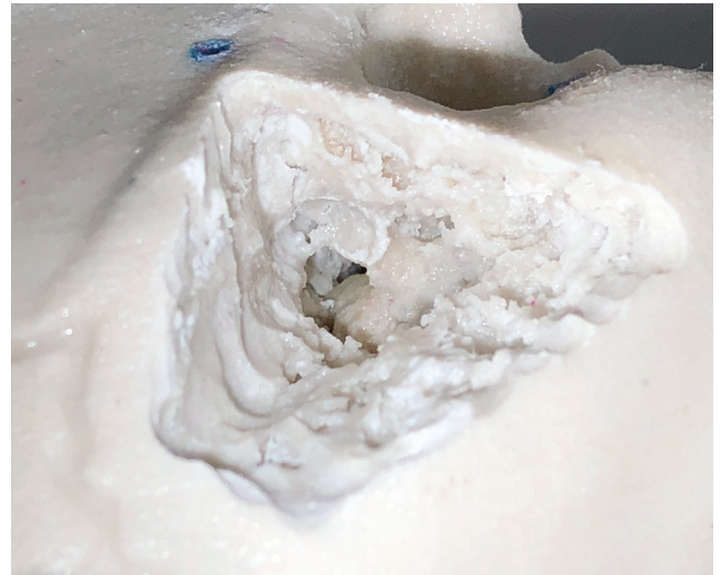
Figure 3. Representative image of a specimen after drilling has been completed. The antrum has been entered, and the horizontal canal can be visualized.

degrees of freedom ( Figure 1 ). Conventional surgical instruments can be fit with adaptors to articulate with the device. For this study, a Midas Rex Legend drill (Medtronic, Minneapolis, Minnesota) with a 4-mm cutting burr was used. The iteration of the technology used was an updated prototype of the robotic platform that we have previously described at length. 12,13,16-19 In summary, its design allows for the user to manipulate the attached instrument with dampening of tremor and heightened precision. The position of the gantry arm and, therefore, attached instrument, is known with a high degree of fidelity. Therefore, after image registration, boundaries of allowable motion (virtual fixtures) can be enforced. When these virtual fixtures are activated, the instrument affixed to the robot is adherent to spatial motion