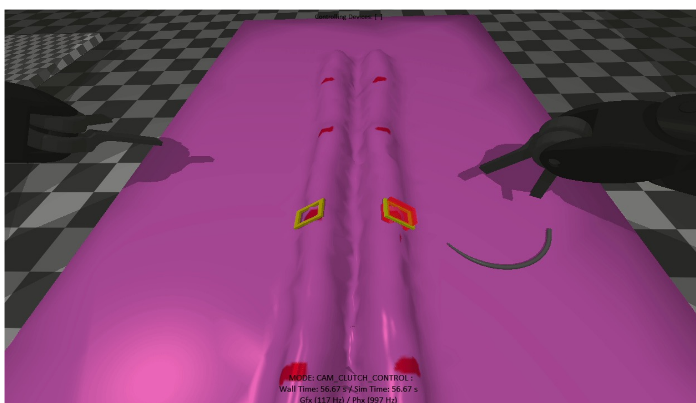
Fig. 1. Surgical Robotics Challenge Simulation Environment 2021-2022 AccelNet Surgical Robotics Challenge

To solve both problems, we present an OpenAI Gym environment based on the AccelNet Surgical Robotics Challenge, a dynamics simulator for robotic suturing. This environment is broken down into 3 challenge tasks: finding the needle, grasping the needle and driving through tissue, and suturing the phantom. We focus on the second challenge in this project.